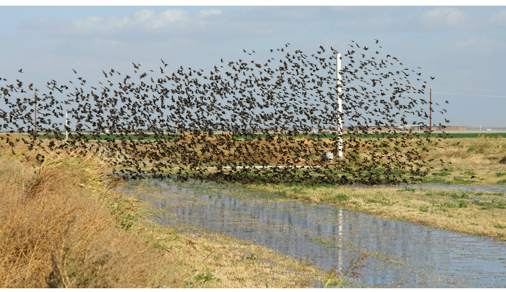
ALL PHOTOS, UNLESS OTHERWISE NOTED: © LARA WEATHERLY

This Policy Brief summarizes the results of a study on the potential for strategic habitat restoration in the San Joaquin Valley of California as an important part of reducing overall water demand to achieve groundwater sustainability under the Sustainable Groundwater Management Act (SGMA). It also provides policy recommendations based on these results and the existing barriers and opportunities for land restoration. The study was conducted by The Nature Conservancy (TNC), the Natural Capital Project and Water in the West Programs at Stanford University to assess the opportunity for upland habitat restoration on agricultural lands that may come out of production due to water use constraints that will be imposed as part of SGMA. The views expressed in this summary are those of The Nature Conservancy.