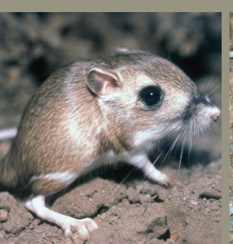
FIGURE 1: Focal species included in the study.